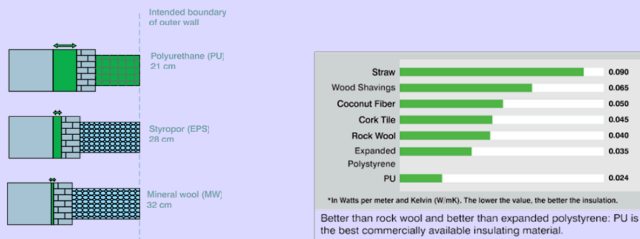
Figure 3: Space saving with different insulation materials

Rigid polyurethane foam is suitable for extended use at temperatures of -30 to +120^{\circ}\text{C} . Even contact with the chemical substances typically found in construction, such as adhesives, wood preservatives or bitumen, does not affect polyurethane. The material does not rot, resists mold and is odor-neutral.